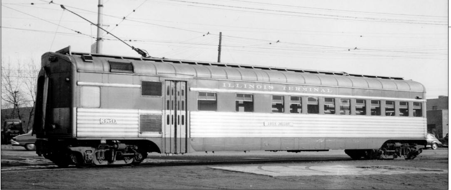
On January 12, 1950, cars ▲ 350 and ▼ 331 are being turned individually at East Peoria. There was so little room in the Farm Creek Yard that a curve with sufficient radius could not be constructed.