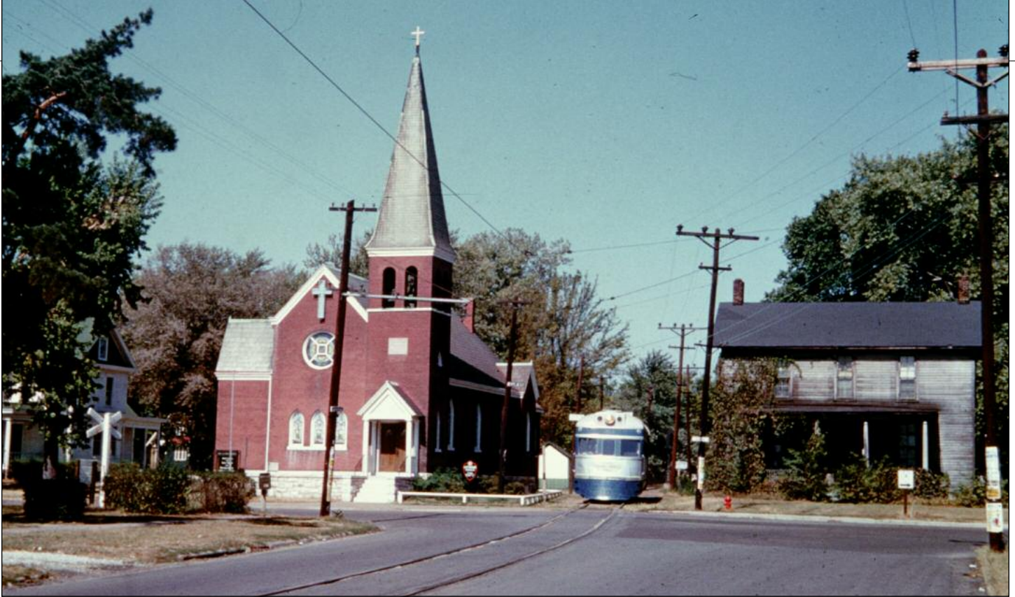
▲ On June 12, 1955, all passenger service north and east of Springfield was abandoned. This series of photos was taken when only two round trips between Springfield and St. Louis were operated. Car 301 is entering Gillespie, the first town south of Carlinville. Most likely this is southbound train 83 that departed Springfield at 9:50 a.m. with a scheduled arrival in St. Louis at 12:45 p.m.