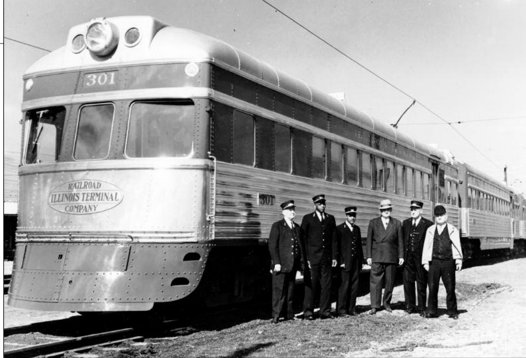
▲ The crew and an official are posed at East Peoria on February 28, 1949. The labor cost on these trains was significant.

Another serious operating problem was caused by the physical nature of the IT itself. Unlike the North Shore whose Electroliners ran over a roadbed deeply ballasted with crushed rock, little of this was found on IT track which was largely ballasted with cinders and gravel. There was also dust from street running in several locations. The basic problem was that IT was a "dirty" railroad and from the beginning shopmen reported large amounts of cinders and dirt accumulating in the traction motors which contributed to motor failure. Some shop reports indicated GE was made aware of the problem and fabricated new screen covers to fit over the tops