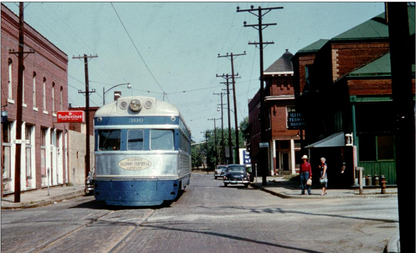
▲ The first Streamliner was delivered on October 17, 1948, and the trouble began almost immediately thereafter. There was considerable side thrust, a broken gear drive on car 330, dirt and cinders into the motors that caused deterioration of their insulation, bearings on motor pinion failing and control panels “blowing up.” Test runs included a “dirt test run” round trip between St. Louis and East Peoria on February 11, 1948, following the application of screening. Car 301 is in Staunton on May 30, 1955.