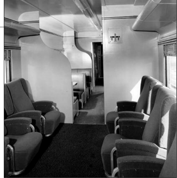
Interior photos of ◀ coach 330, ▲ parlor seating and dining area of car 350 and ▼ parlor and observation area of parlor car 350.

and wider. The Electroliner control was manual and provided smooth acceleration for the trains with 18 points.