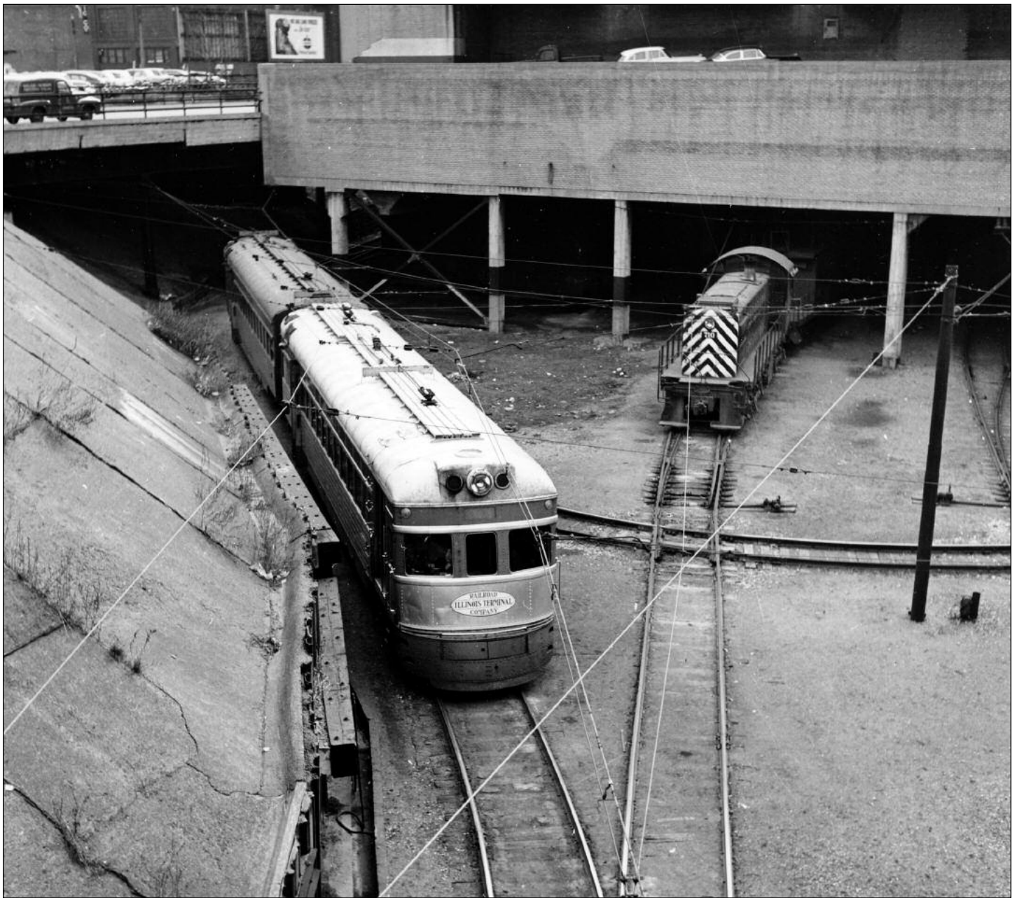
▲ At St. Louis the Streamliner could also not be turned as a trainset. In January 1955, Alco S-2 number 710 is switching the underground freight house. After being wyeed separately, this two-car consist is backing into a station track in preparation for its 5:00 p.m. departure to East Peoria as train 94.

Had the IT streamliners operated over an interurban of the quality of the North Shore or South Shore, their excellent riding qualities and speed would have come to the fore. However, the trains never truly achieved their potential. There were too many service failures owing to traction motors becoming clogged from cinders and dirt along the IT's track, too much street running, curves that were too tight for reliable operation and so on. The Illinois Terminal streamliners were in fact very fine electric luxury trains. Their fatal flaw was that they operated on the Illinois Terminal.