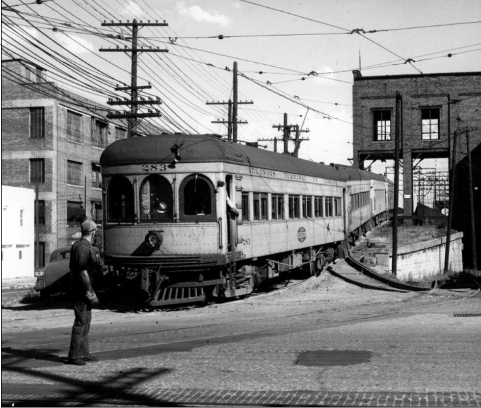
These two photos document the 6 percent descending grade from the Illinois River Bridge and the 4.4% ascending grade into the Peoria station at Washington and Walnut Streets. This is the location where the one and only inbound Streamliner that ran over the Illinois River came to grief. ▲ On July 14, 1946, this train is being backed up the grade to the bridge in the process of a wye movement to turn the train for its outbound trip. On the back of the photo Bill noted the following: "to spot this train he came out of the barn at the right, went up Walnut Street (to the left in the photo), then backed up on bridge, then turned right on Washington Street, then backed around into Walnut Street and into the station." ▼ Looking the other direction (north), train 95, the Mound City, has left the Peoria station at 5:00 p.m. on July 26, 1947. It is on Walnut Street crossing Washington and starting its ascent to the Illinois River bridge.