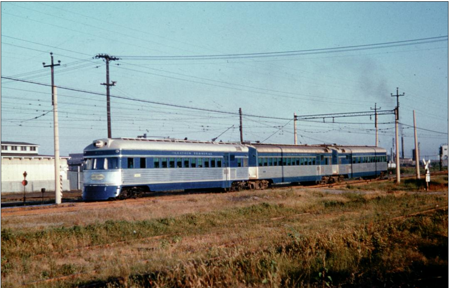
▼ The same trainset is at Branch Street in St. Louis on September 3, 1955. We have completed our photographic journey from Springfield.