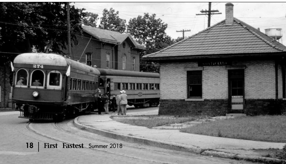
◀ In contrast to downtown Chicago, this curve around a corner in Monticello, was too tight for the Streamliners, thus they could not operate east of Decatur. Monticello is between Decatur and Champaign on the Danville-Springfield line. On May 29, 1955, motor 274 is hauling trailer 531 on an Illini Railroad Club excursion that operated between DeLong (the cut back point between Danville and Urbana) and Springfield with a side trip on the Mechanicsburg branch. In 2018, the Monticello Railroad Museum uses both Illinois Terminal and Illinois Central trackage for their very nice museum operation.