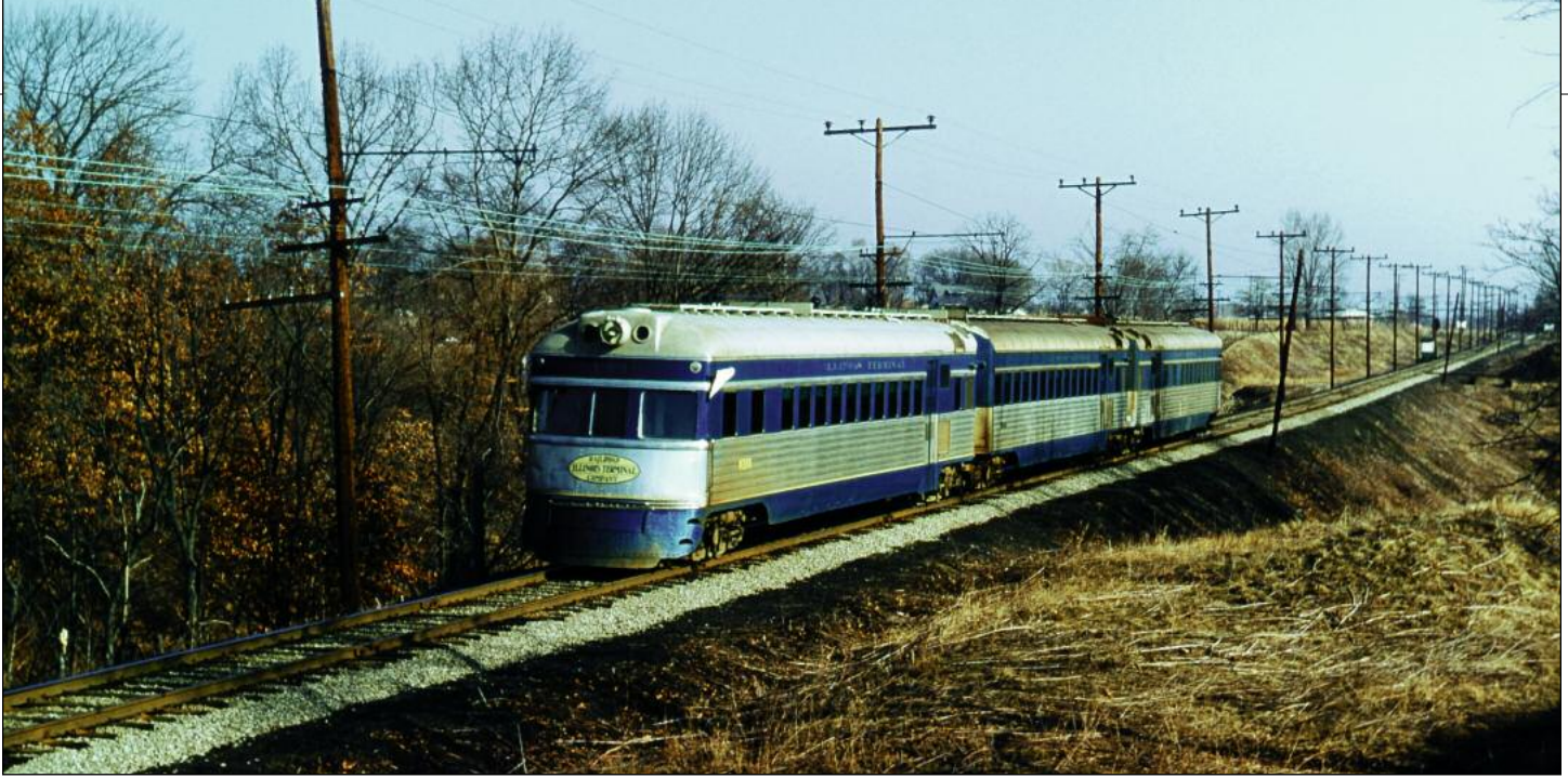
▲ On the morning of March 4, 1956, the day after abandonment of passenger service a Streamliner is leaving Springfield for the last time. Cars 301,331, and 351 are on the Springfield by-pass at Drain Tile.

journal voucher dated for April 1949, the railroad estimated the costs of the eight cars at $890,256.75.