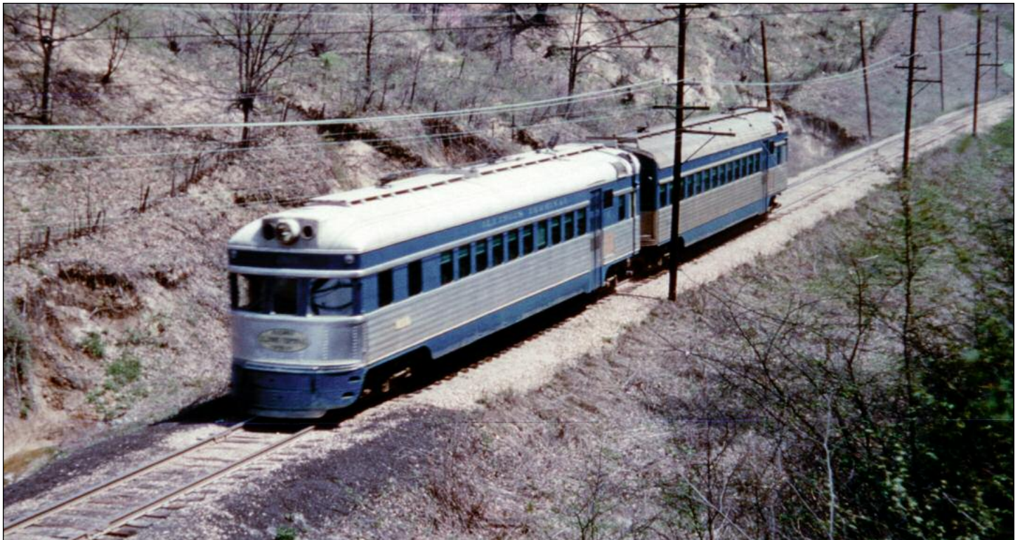
▲ Cars 301 and 350 are descending Caldwell Hill on April 25, 1954, the first day of Central Daylight Time. This is most likely train 90, the 8:30 a.m. departure from St. Louis, scheduled to arrive at East Peoria at 1:15 p.m. At this time railroads published their schedules on Standard Time so riders had to convert the schedules to Daylight Time to be at their station at the appropriate time. The cinder ballast proved troublesome for the Streamliners. Washouts on Caldwell Hill, as evidence by the fresh ballast, added to the IT’s track situation.

Illinois Terminal placed an order with St. Louis Car Company in June 1946 to construct what would be eight new streamlined cars to be operated in three trains. The line was confident that its new streamliners would be as successful as the Electroliners since, after all, assembly of the IT cars was being done by the same builder. St. Louis Car Company soon began construction of the new cars according to specifications submitted by the IT. It is unknown whether IT assigned its own onsite representative to monitor the construction as the North Shore Line had done when the Electroliners were being built in 1940. According to a company