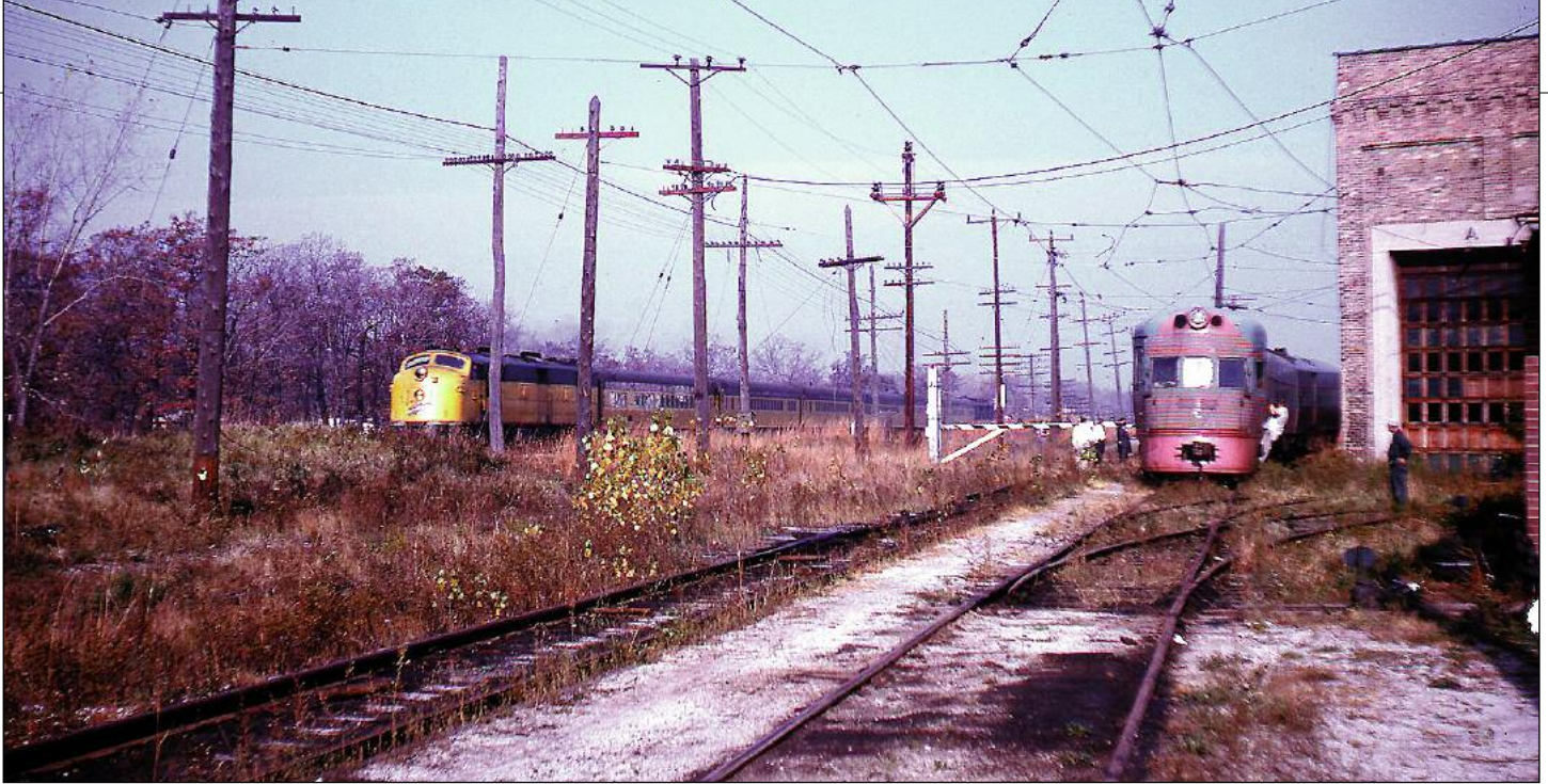
▲ The two Electroliners left Highwood for the last time in the summer of 1963. They were interchanged to the Chicago & North Western at Highwood heading to the Red Arrow Lines to operate between Philadelphia's 69th Street Terminal and Norristown, Pennsylvania. Shore Line has published many Electroliner photos so in this article we are going to concentrate on Illinois Terminal photos.

memo also noted: "We understand that profit from tavern-lounge operations on the North Shore 'Electroliners' pays entire operating costs of these trains."(!)