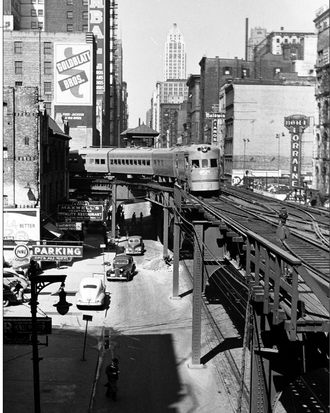
▲ Having been designed by the engineering department of the Chicago Rapid Transit Company, the Electroliners could easily navigate the curves around street corners in Chicago’s Loop. In 1941, this southbound Electroliner is at Tower 12 turning from eastbound over Van Buren Street to southbound over Wabash Avenue.

Much forethought went into the design of the Electroliners while some of the design elements of the streamliners appear