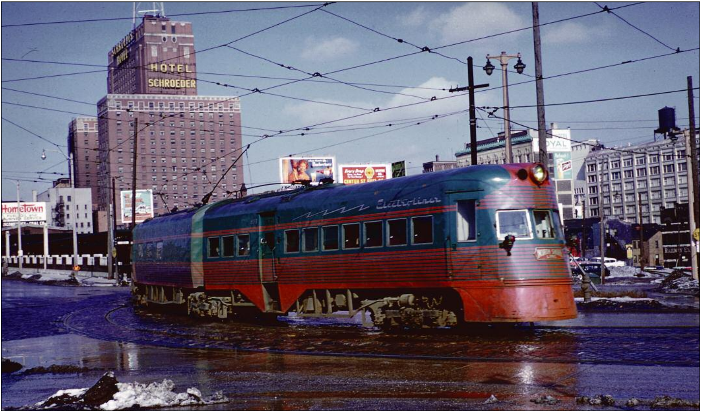
▲ Electroliner 803-804 is traversing the reverse curve at 6th Street and Clybourn Avenue to enter the Milwaukee Terminal. The photo clearly shows the addition to the pilot to bring it closer to the rails and the framing to protect the underbody equipment. These additions were the result of a collision of this unit with an automobile in June 1941. The train overrode the vehicle causing considerable underbody damage. ▼ In the Summer of 1961 this southbound Electroliner is traversing the “S” curve at the Chicago Avenue station on the North Side elevated. This trackage was shared by Ravenswood, Evanston Express and North Shore Line trains.