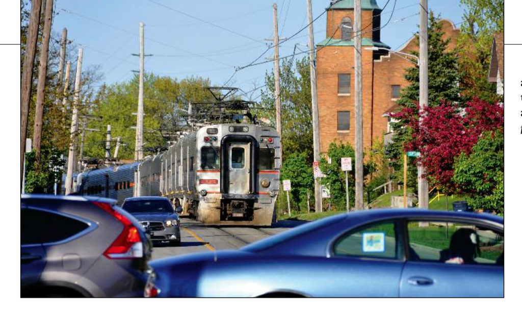
◀ Train 111 has made its last stop in the street as it heads for Carroll Avenue and the end of its trip on April 30, 2021. The challenges of vehicles and trains is clearly demonstrated.

▶ We are looking basically east on 11th Street at Church Curve. Cedar Street is in the foreground. The church suffered a devasting fire years ago and has been unoccupied since then. The congregation is most eager to receive the proceeds of the sale so they can move forward with their plans. This curve is to be realigned as well.