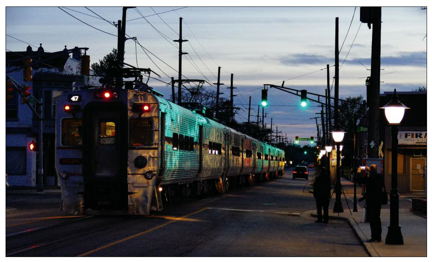
▲ Train 22 departs westbound after making its final stop in 11th Street. ▼ Train 19 arrives eastbound. This is the 7:10 p.m. departure from Chicago that is scheduled to arrive Michigan City at 9:04 p.m.