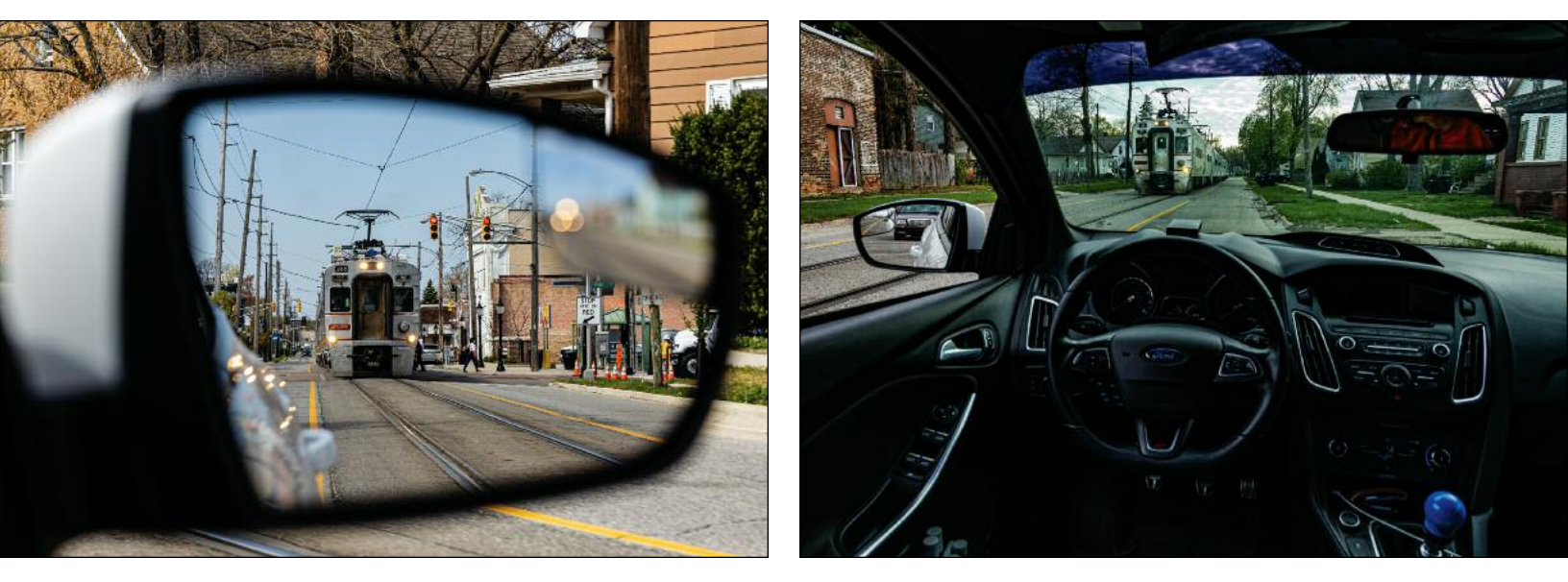
John C. Spychalski, by substantial contribution, has made it possible to publish this page

▲ On April 30, 2021, car 307 leads the way down 11th Street at the Washington Street crossing with a morning eastbound move back to Carroll Avenue. The flowers on this tree were hard to pass up as the bi-levels glide down the street in the morning light. One thing that will remain after the double track project will be the house seen on the corner, although the tracks will be mere feet from their front porch. ▲ A lone passenger disembarks from eastbound train 107 as it finishes up its station stop at 11th street as viewed from the driver's side mirror of my Ford Focus. ← Another view from my Ford Focus gives a driver's view of an approaching train. Can you imagine what some people think when it is a freight train coming at them?—Three photos and captions by Joseph Trepasso