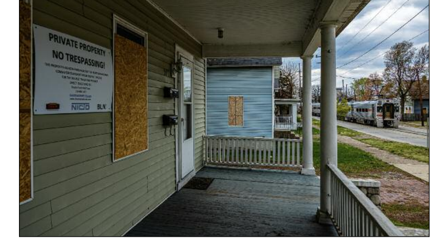
• As seen from the porch of 517 E. 11th Street on April 23, 2021, eastbound train 9 is coming out of the famed S curve at the First Christian Church as it starts up the grade on 11th Street. With a last name like "Trepasso" it's no wonder I spent the day shooting from as many of the condemned porches as I could to get the "as it was" feel for the streets of Michigan City. Soon, photos like this will be a thing of the past.