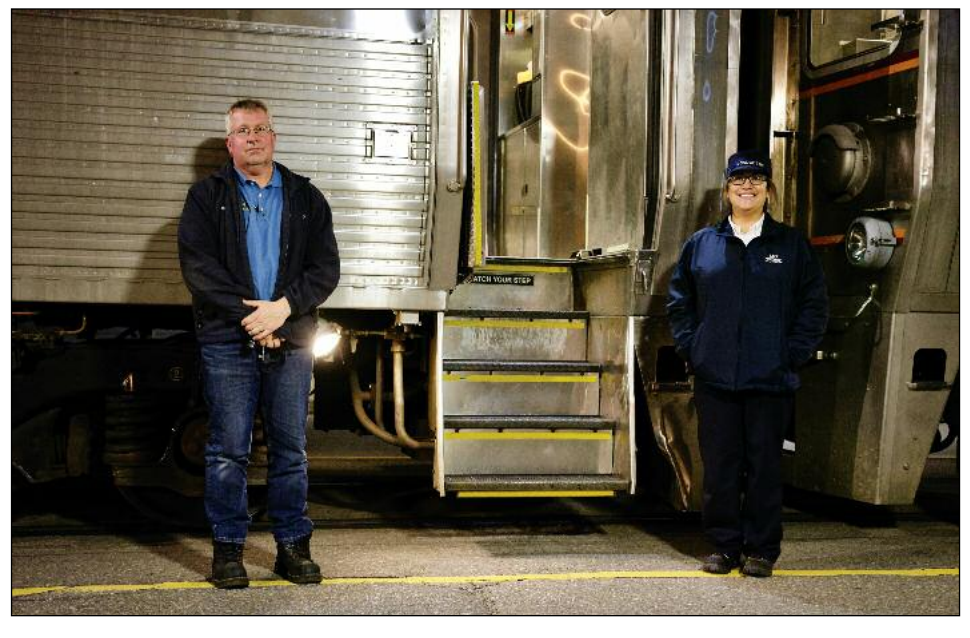
← The train was held for approximately 10 minutes to document this historic event. Michigan City Transit buses will provide scheduled service to the Carroll Avenue station. When the new station is completed, passengers will access trains from a high-level platform that will not be in the street.